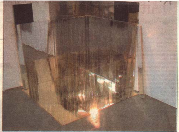
Above: I Do by Tom Orr (2003); mirrors and wood

Mr. Orr's Peacock uses a square, concave array of nearly 600 tiny mirrors — the panel appears to have been removed from