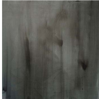
Untitled (Mussolini), 2007 by Jeff Zilm