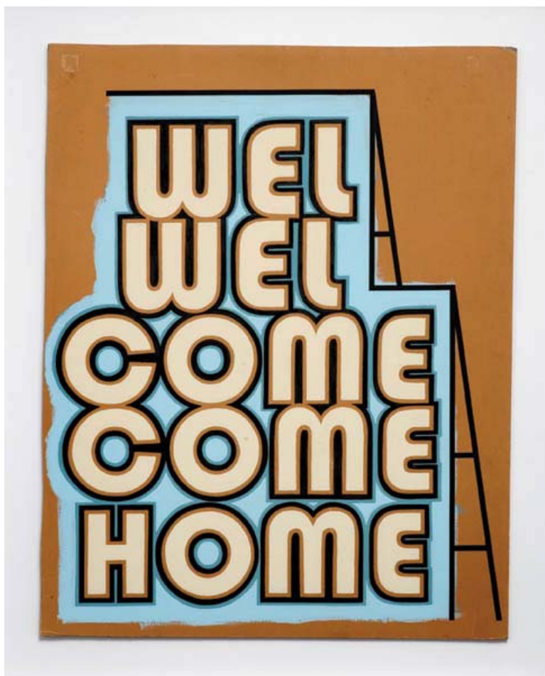
Archie Scott Gobber Welcome Home acrylic, artist tape on vintage board 28" x 22"