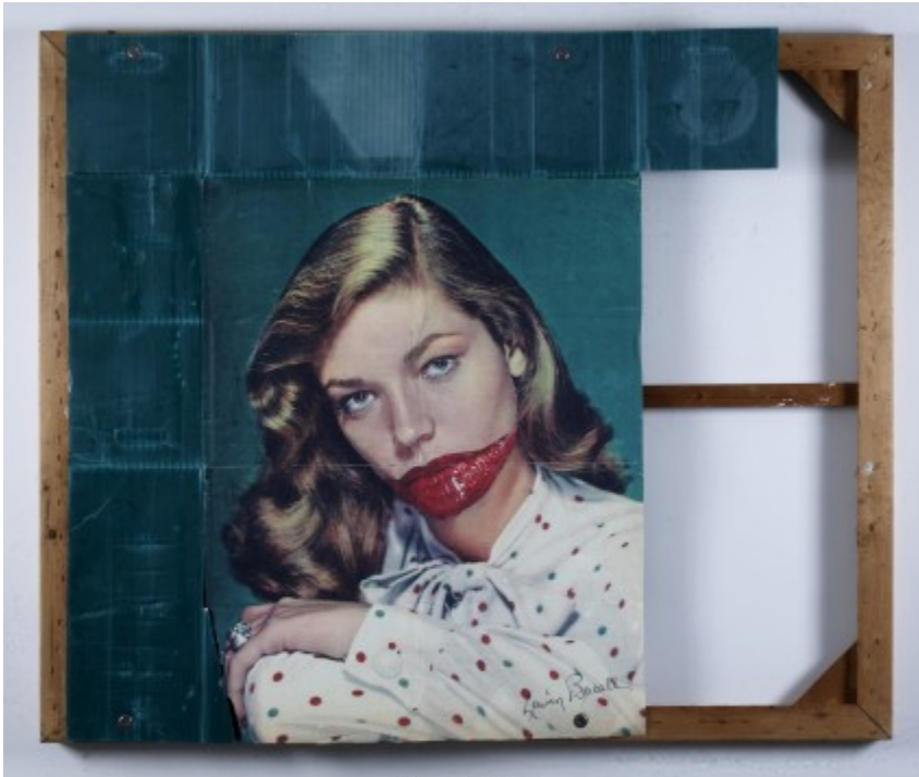
Mark FLOOD Green Box, 2008 Painting - Collage on found coroplast, mounted on wood frame 50 x 60.5 inches (127 x 152.4 cm) MF 7885