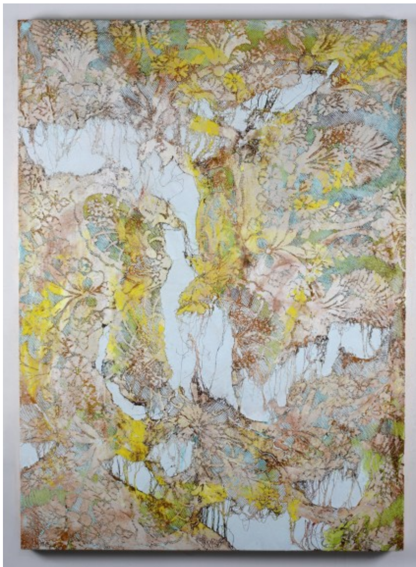
Mark FLOOD Spring Puddle, 2008 Painting - Acrylic on canvas 66 x 48 inches (167.6 x 121.9 cm) MF 7876

Courtesy Peres Projects Berlin Los Angeles