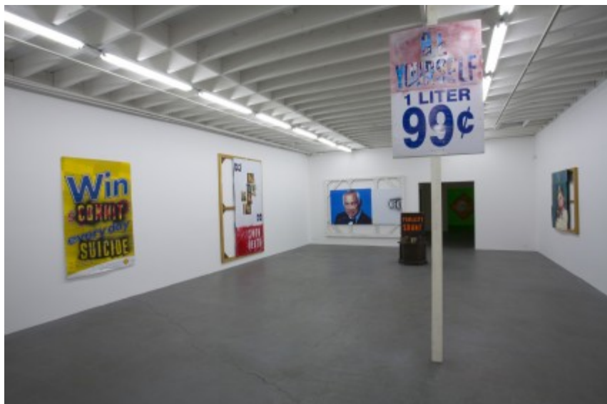
Mark FLOOD Entertainment Weekly, 2008 Installation view