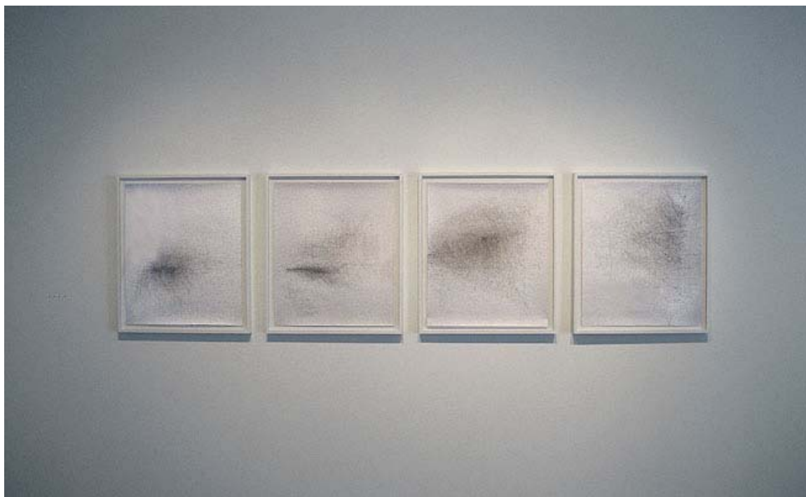
WILLIAM LAMSON, Sea Drawings , Coliumo, Chile, 2009 (installation depicting the transition from high tide to low tide)