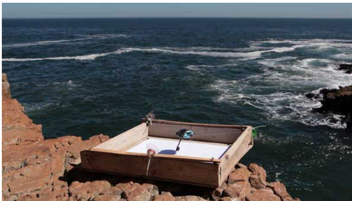
WILLIAM LAMSON, Automatic , 2009 video still of Sea Drawing Apparatus

http://renegadebusdallas.com/mid-century-neon/william-lamson-automatic/