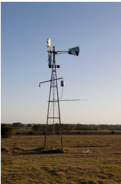
WILLIAM LAMSON, Molino Drawing , Colonia Valdense, Uruguay, 2009 (L: Molino Drawing .575 liters, Jan 31, 9-12p -detail, R: Molino Drawing Apparatus )