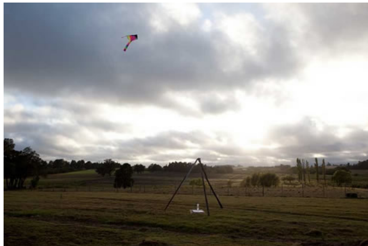
WILLIAM LAMSON, Kite Drawing , Colonia Valdense, Uruguay, 2009 (L: Automatic -video still, R: Automatic Kite Drawing -marker on paper)