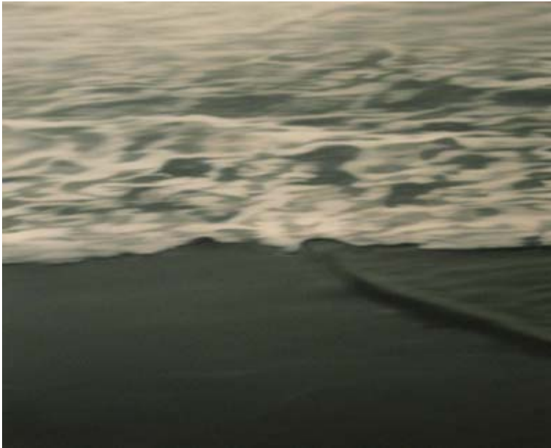
"Pacific (Surface)," 2007, oil on titanium, 15 x 18 5/8 inches Collection of the Dallas Museum of Art