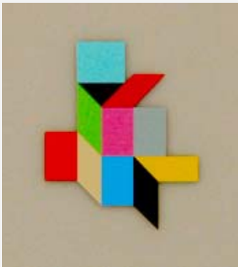
"Mutation Drawings," 2010, Enamel, Scotchcal, acrylic, framed, 21 x 17 x 1 inches each

Unlike Judd etc. who used industrial metal fabricators, Pard personally produces his sculptures to reveal the hand of the artist. He skillfully welds brightly colored variously sized aluminum panels and cubes and bakes multiple layers of color pigment combinations onto them in a process he terms "patination." While the edge of each section of color is sharply defined, the application of color has a soft painterly effect, with some of the gray of the aluminum purposefully showing.