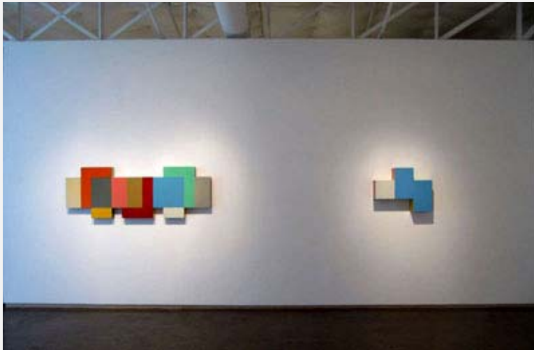
"Flora," 2010, patinated aluminum, 25 x 70 x 3 inches and on the right